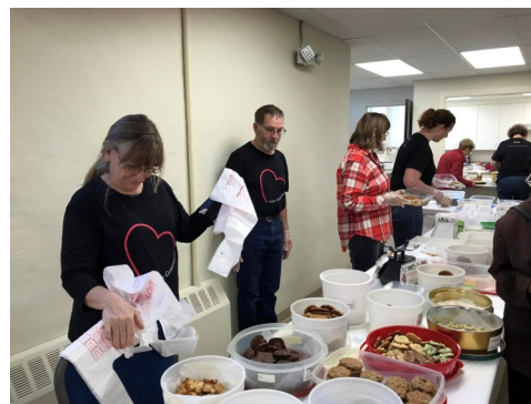
Above: Christmas Cookie Sales