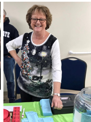
Right: Basket Raffle Ticket Sales